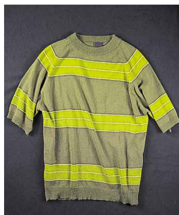
A sweater worn by the late Kurt Cobain is on display at the Experience Music Project.

THROUGH APRIL 22, 2013 SEATTLE "Nirvana: Taking Punk to the Masses" : What Liverpool is to the British Invasion or Detroit to Motown, Seattle is to grunge. So it's only fitting that the most extensive exhibition on Nirvana, the genre's most important band, should be mounted there, at the Experience Music Project. The show includes more than 200 items, ranging from fans' oral history accounts to a sweater worn by the band's late singer-songwriter-guitarist, Kurt Cobain. Other objects include guitars, a painting Cobain did in high school, a reel-to-reel tape machine owned by his aunt, handwritten lyrics to several of the band's songs, and numerous candid photographs from Nirvana's early years. 325 5th Ave. North, 877-367-7361, www.emp.museum.org